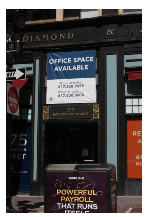
Figure 12. Washington Street building entrance.