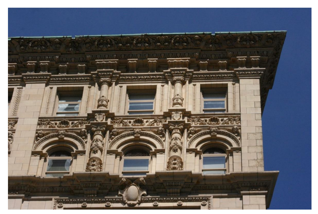
Figure 8. Washington Street elevation, detail of floors 9 and 10.