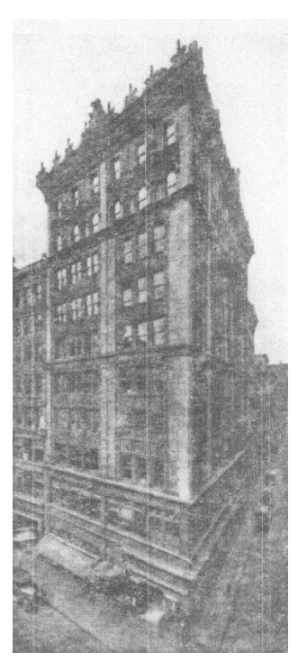
Historic Image 3. Completed Jewelers Building, ca. 1920s.