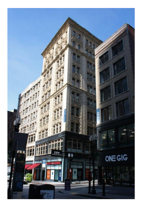
Figure 2. Washington Street (L) and Bromfield Street (R) facades.