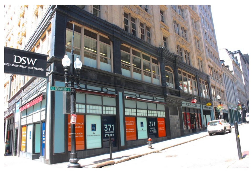
Figure 5. Bromfield Street facade, storefronts.