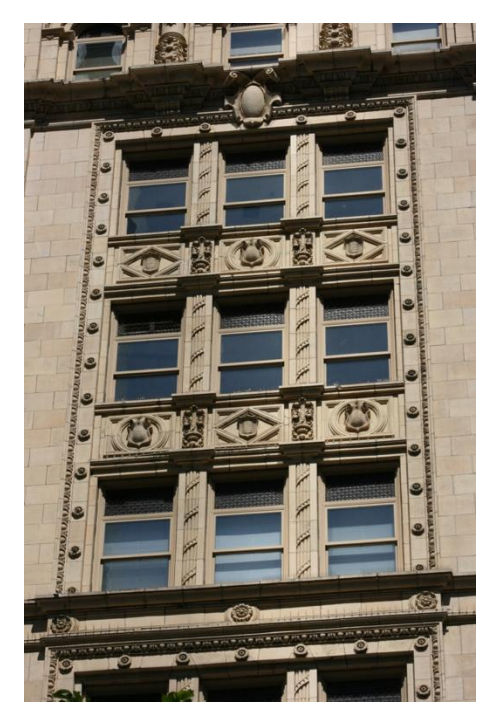
Figure 7. Washington Street façade, detail of floors 6, 7, and 8.