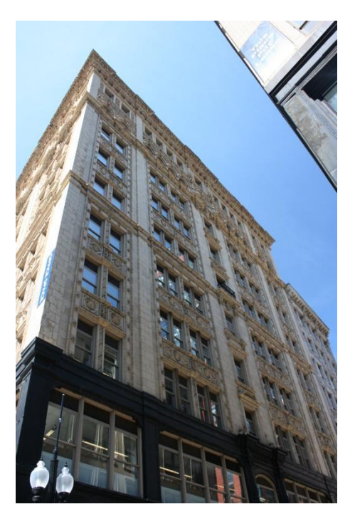
Figure 4. Bromfield Street (north) façade.