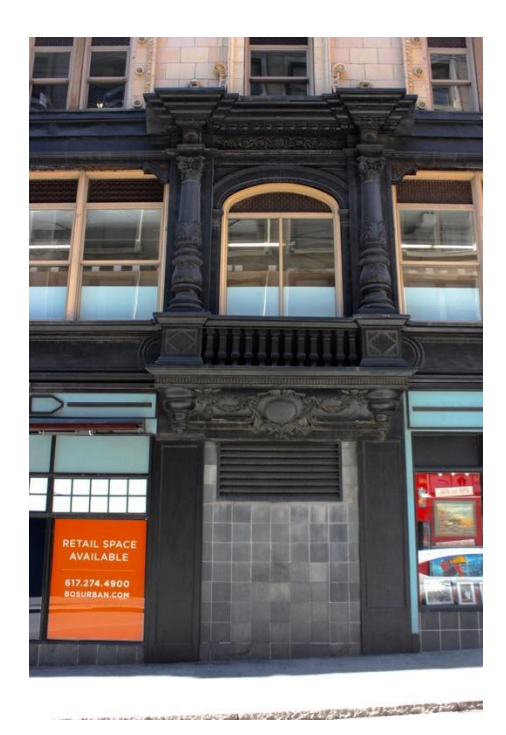
Figure 11 . Bromfield Street building entrance.