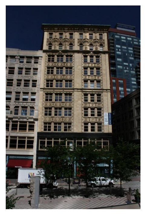
Figure 3. Two-bay Washington Street (east) façade.