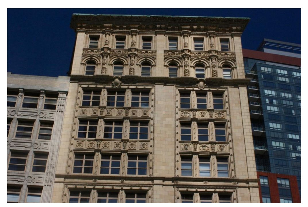
Figure 6. Washington Street façade, floors 6 through 10.