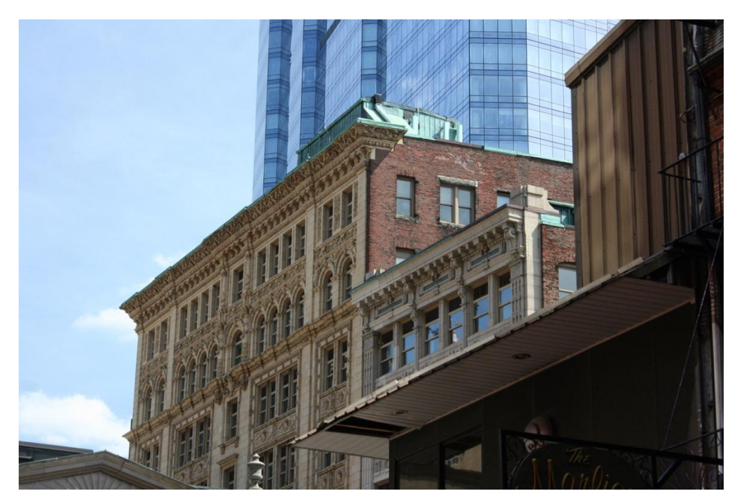
Figure 10. Bromfield Street (north) and west elevations.